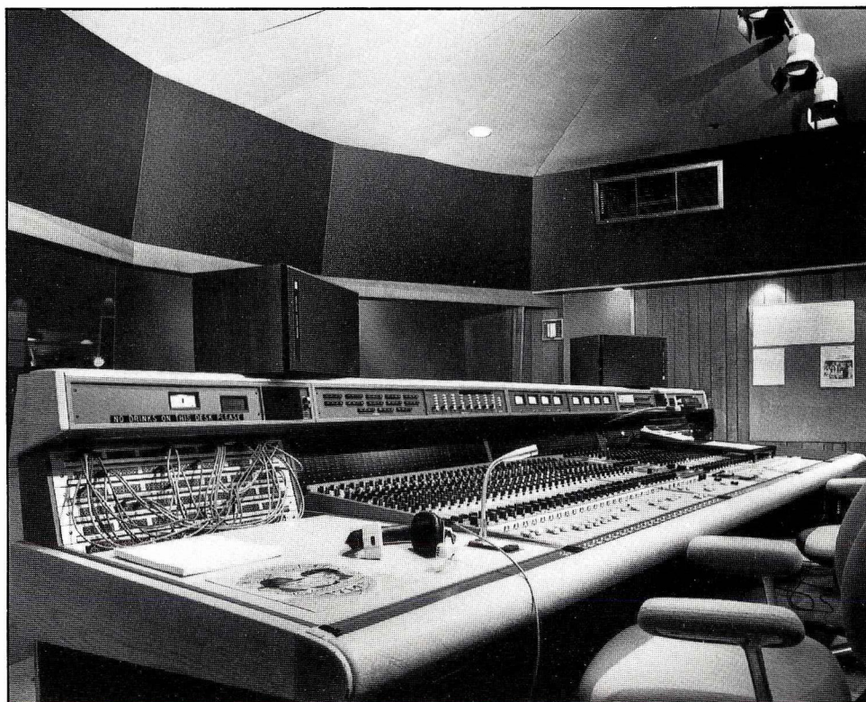
Scoring Stage 10, Universal Studios, Universal City, CA

Doc Goldstein, Chief Engineer Universal Studios Sound Department